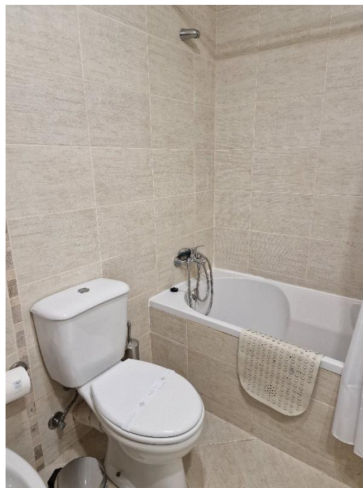
Espaço entre a banheira e a sanita