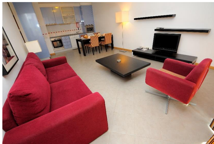
Zona de estar T1 60 m2