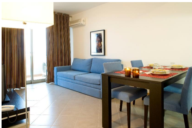
Zona de estar T1 50 m2