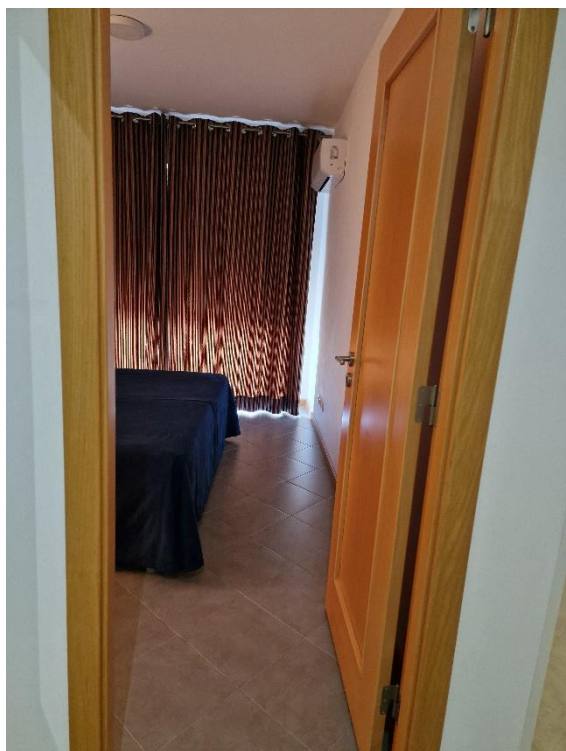
Entrada para o quarto