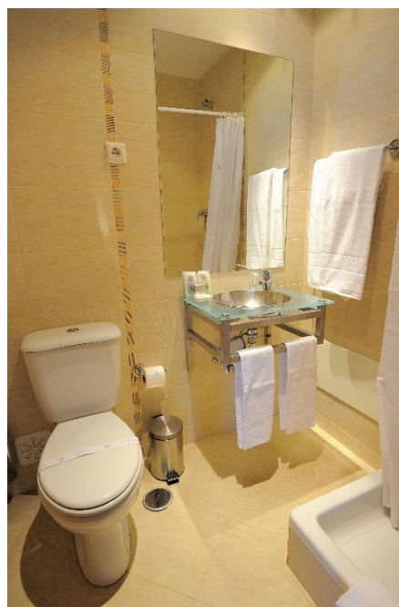
Casa de banho duche – T2 – 120 m2