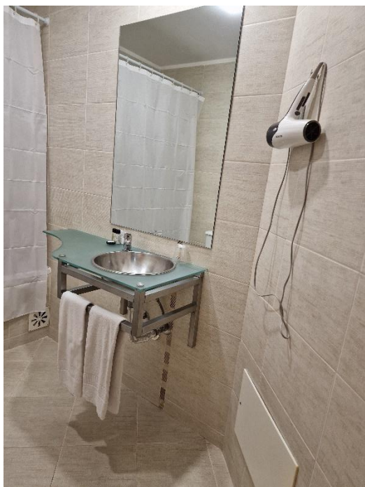
Altura do lavatório