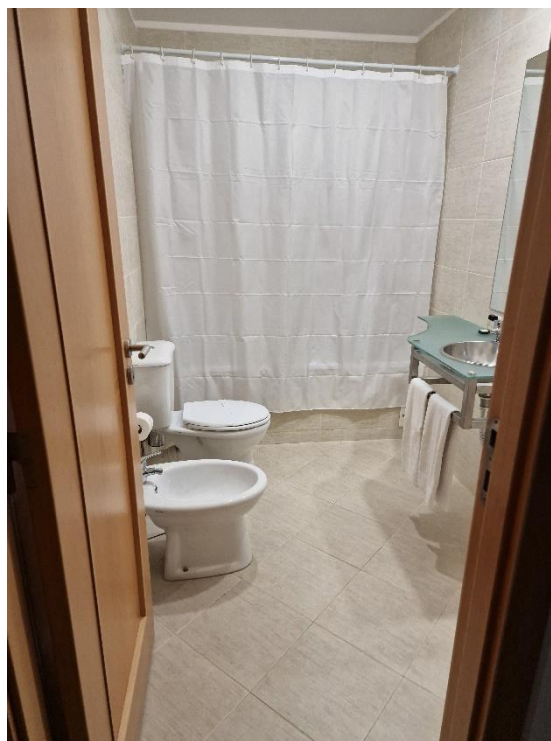
Entrada para a casa de banho T1 – 50 m2 e 60 m2