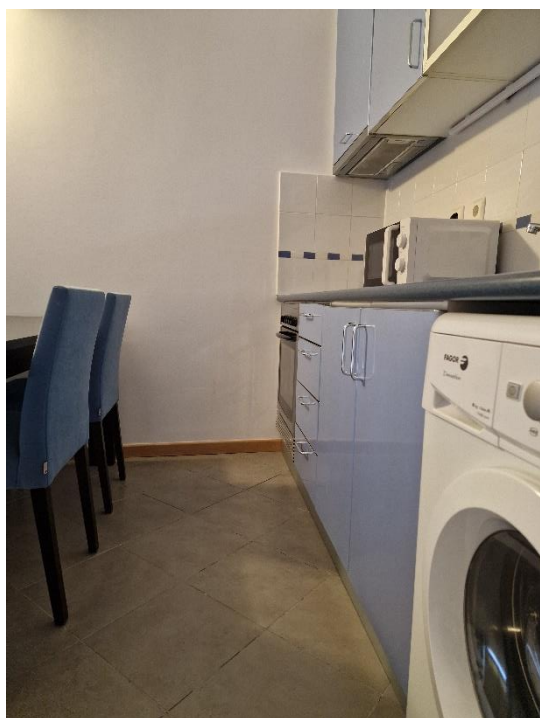
Espaço entre a mesa de refeições e kitchenette