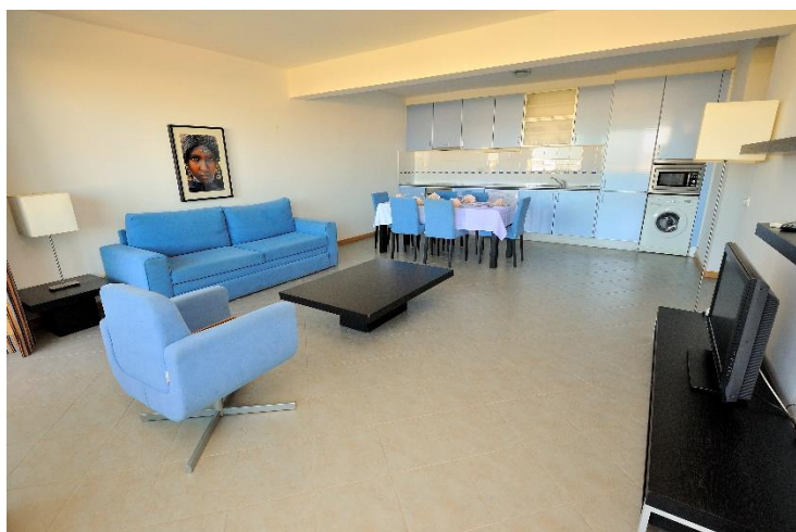
Zona de estar T2 – 120 m2