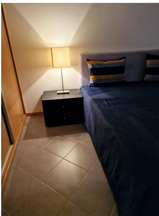
Espaço entre a cama e o roupeiro