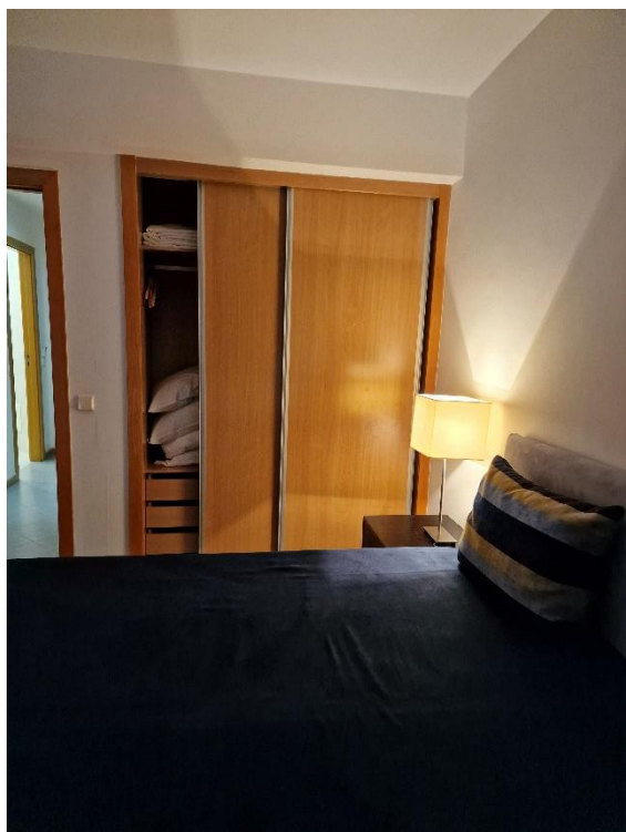
Vista do quarto 50 m2